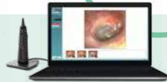
Viot™ Video otoscope