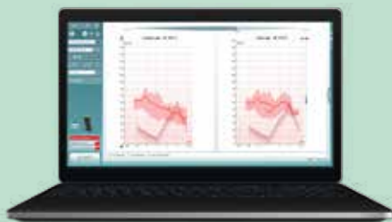
Visible Speech Mapping (optional)