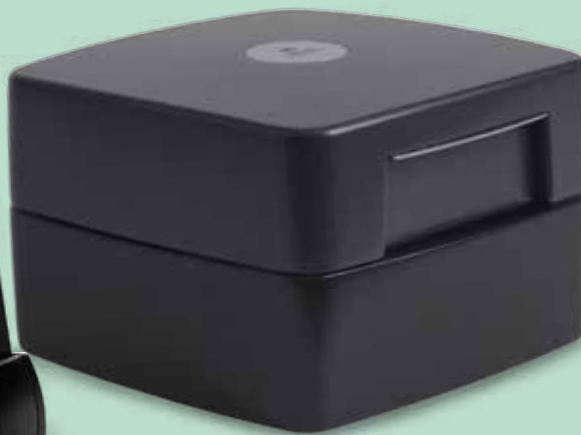
TBS10 test box for Hearing Instrument Testing