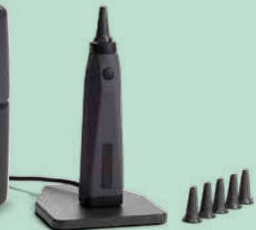
Viot™ video otoscope offers full integration in the Callisto™ Suite