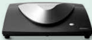
Affinity 2.0 The integrated fitting solution