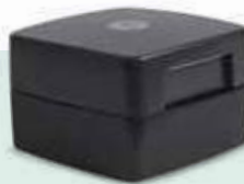
TBS10 Test box