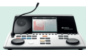
AD629 Diagnostic audiometer