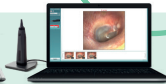
Viot™ Video otoscope